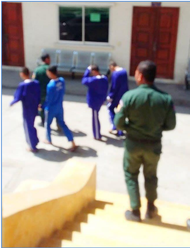
CCHR: defendants in convicts' uniform

Rule 115 of the United Nations Standard Minimum Rules for the Treatment of Prisoners (The Nelson Mandela Rules), adopted by the General Assembly in 2015, states that “An untried prisoner shall be allowed to wear his or her own clothing if it is clean and suitable. If he or she wears prison dress, it shall be different from that supplied to convicted prisoners.” While this document is not legally binding on Cambodia or other UN Members, it represents an internationally recognized best practice for the treatment of prisoners. In the Extraordinary Chambers in the Courts of Cambodia (“ECCC”), defendants are permitted to wear their own clothes at all stages of the criminal process until final conviction.