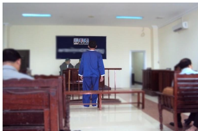
Above: An accused in the blue prison uniform of Cambodia